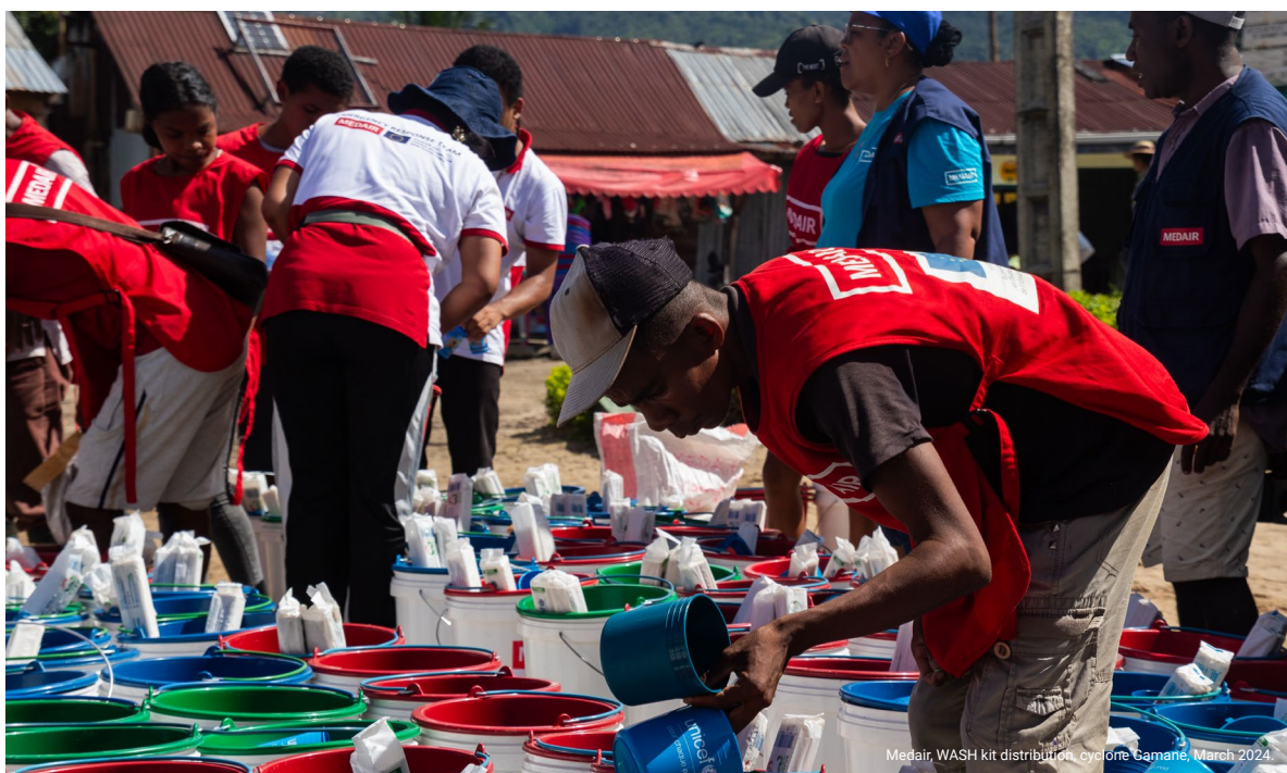
Medair, WASH kit distribution, cyclone Gamane, March 2024.

Start Ready has been transformative in anticipating crises and protecting communities ahead of their onset. Madagascar was one of the 7 countries included in the second Start Ready Risk Pool, which ran from May 2023 to April 2024. During this period, Start Ready activated in anticipation of two major crises in Madagascar - drought in February 2024 and Cyclone Gamane in March 2024.