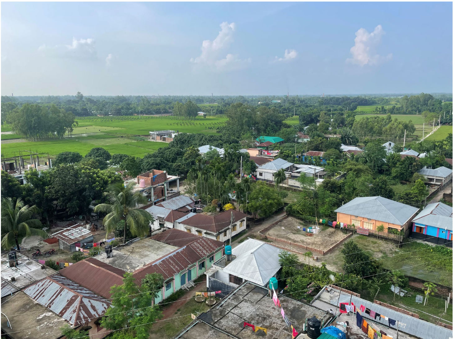
2023 View of a village in Thakurgaon, Bangladesh, taken from ESDO's office.

This research has highlighted the important role Start Network has in supporting local hosts. The following recommendations have been identified by this research as ways Start Network can support future local hosts.