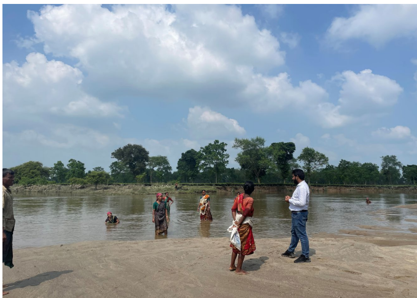
2023 Women fishing at the border with India, Thakurgaon, Bangladesh.