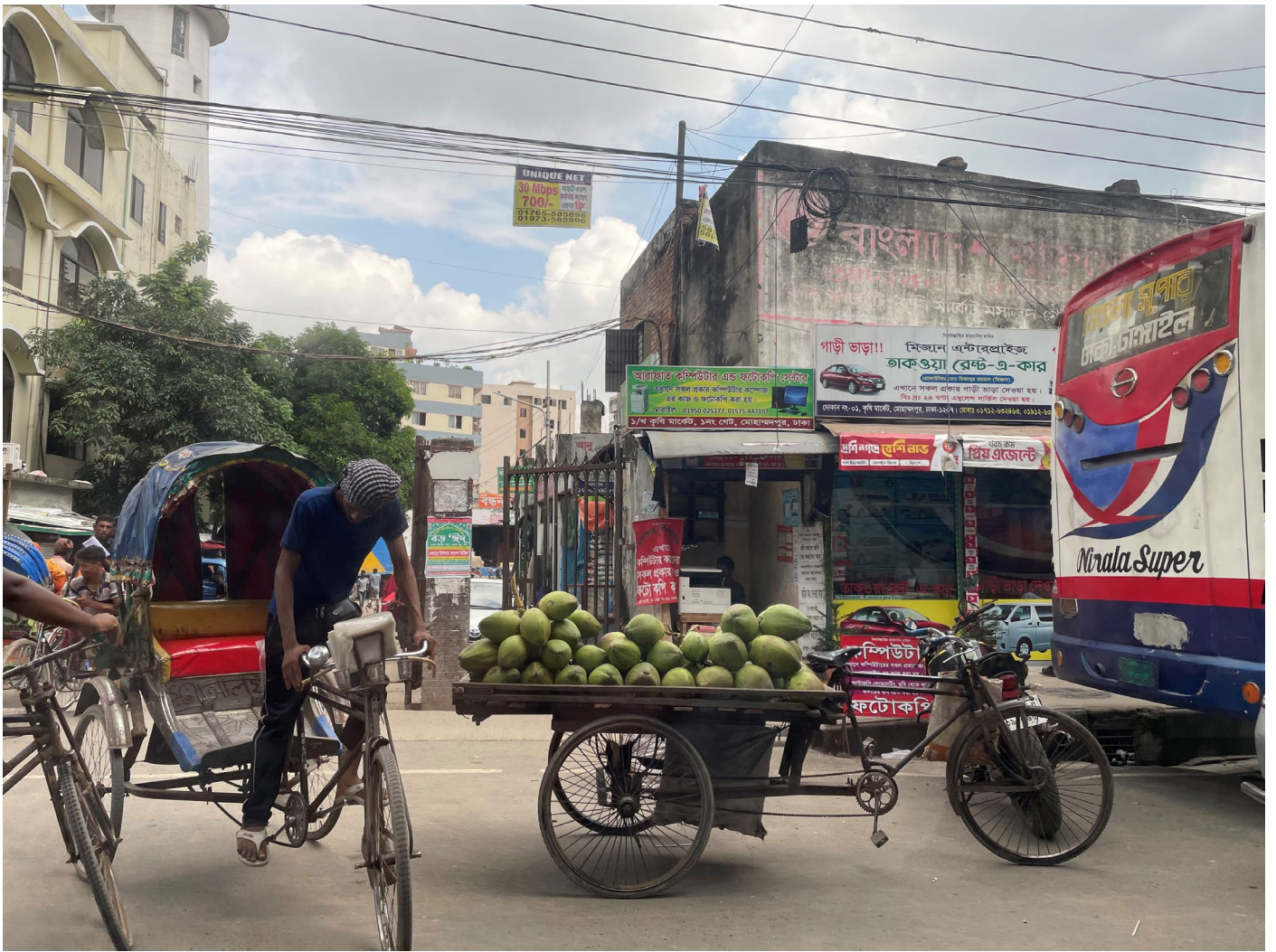
2023 Hustle and bustle in Dhaka, Bangladesh.